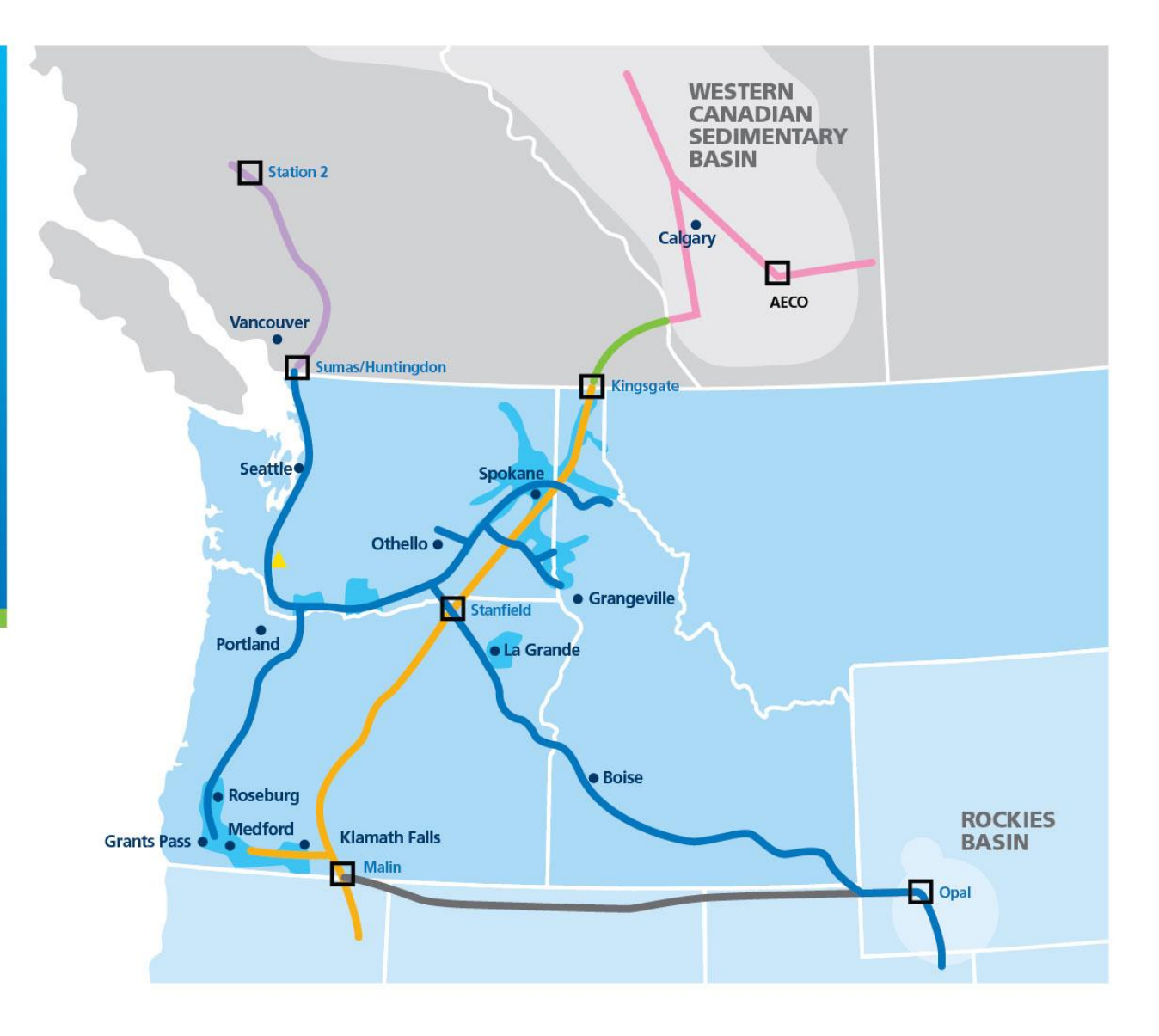
Exhibit No. 1 Case Nos. AVU-E-23-01/AVU-G-23-01 D. Vermillion, Avista Schedule 1, Page 3 of 3