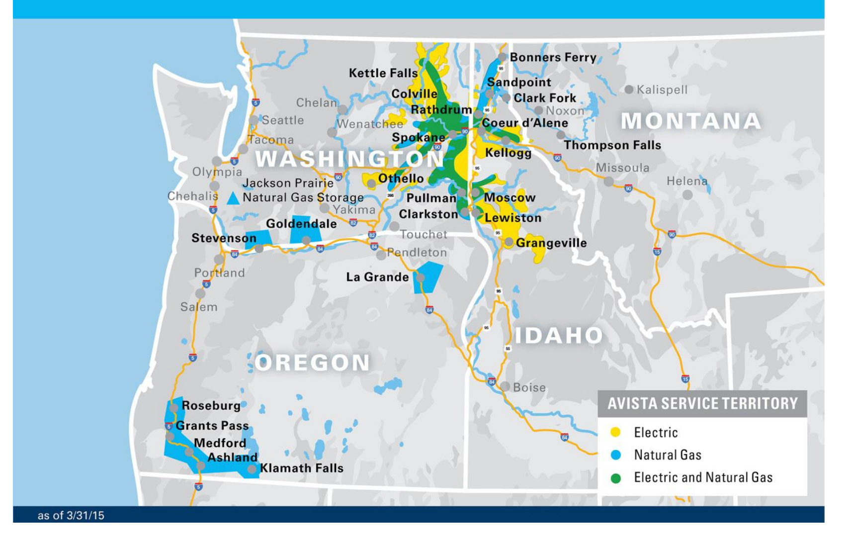
Exhibit No. 1 Case Nos. AVU-E-23-01/AVU-G-23-01 D. Vermillion, Avista Schedule 1, Page 2 of 3